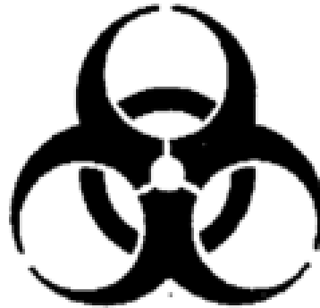
Biological Hazard Symbol Configuration

(ii) The symbol design for biological hazard tags shall conform to the design shown below: